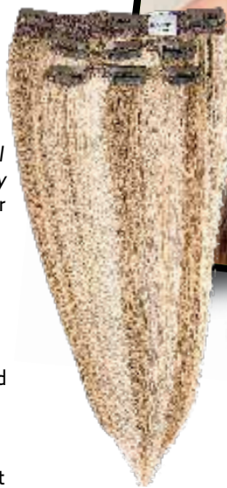
Hidden Crown 14-inch Original Clip-In Extensions, $149, hiddencrownhair.com