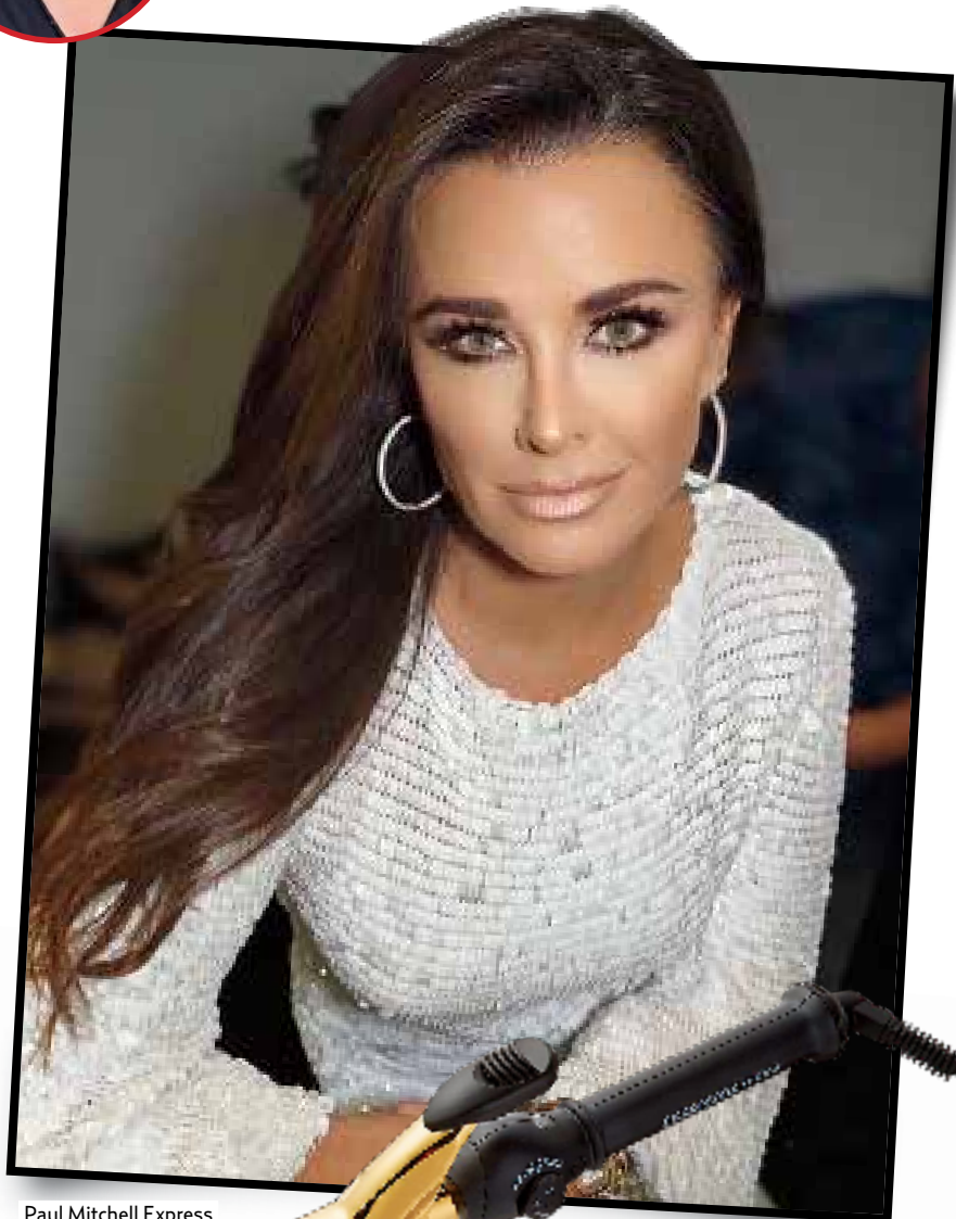
Paul Mitchell Express Gold Titanium 1.25-inch Curling Iron, $68, paulmitchell.com