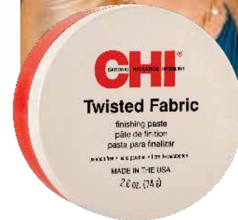
Chi Haircare Twisted Fabric, $16, chi.com