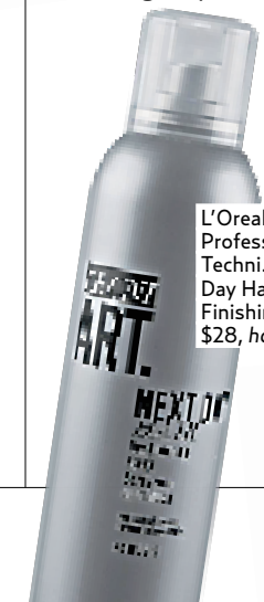
L'Oréal Professionnel Techni.Art Next Day Hair Dry Finishing Spray, $28, hair.com