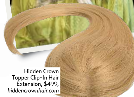
Hidden Crown Topper Clip-In Hair Extension, $499, hiddencrownhair.com